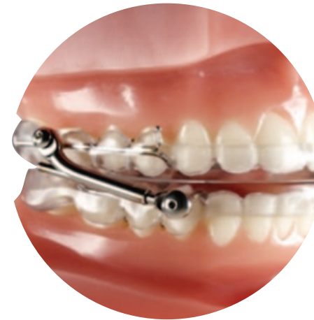
Sleep apnea appliance

Obstructed airways can often be corrected with an appliance. Talk to your Stellar Dental Care professional to see if this may be right for you.